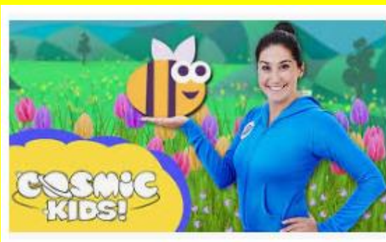
Enzo the bee yoga activity