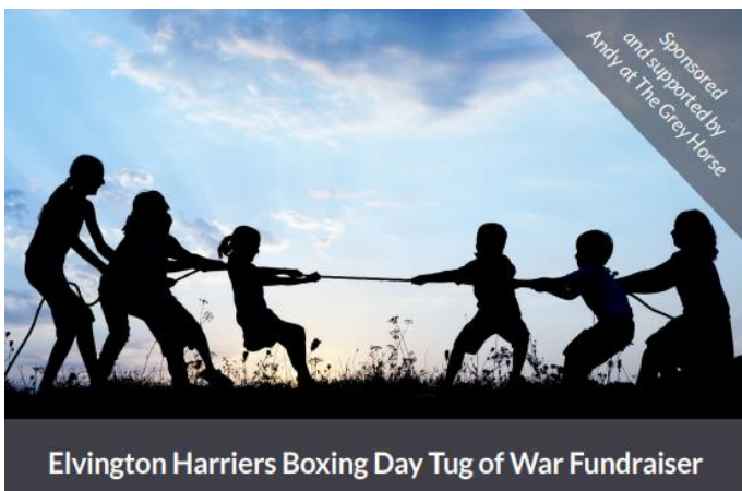
Elvington Harriers Boxing Day Tug of War Fundraiser

The BCSY (Bereaved Children Support York) is an organisation that looks to support bereaved children and their families in the York area. They can offer 'drop-in sessions' and one to one therapeutic support. Please see their website for further information.